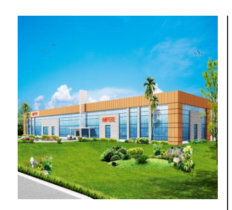
Extending Greaves' Mfg. & SCM Capabilities to enable rapid backend scale-up at Ampere