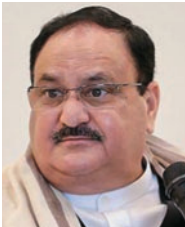
J P Nadda